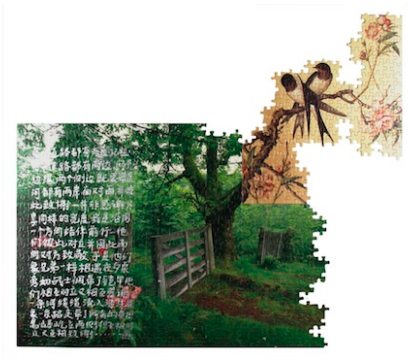
Figure 7: Every Road Has Two Paths , 2015. Jigsaw and paint, 62cm x 56 cm.