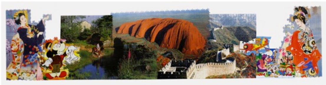
Figure 11: Entering Anarcadia 2015 Jigsaw 230cm x 50cm