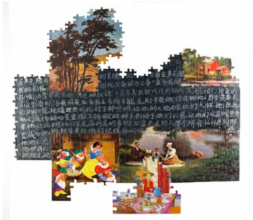
Figure 6: A Happy Occident , 2015. Jigsaw and paint, 62cm x 56 cm.