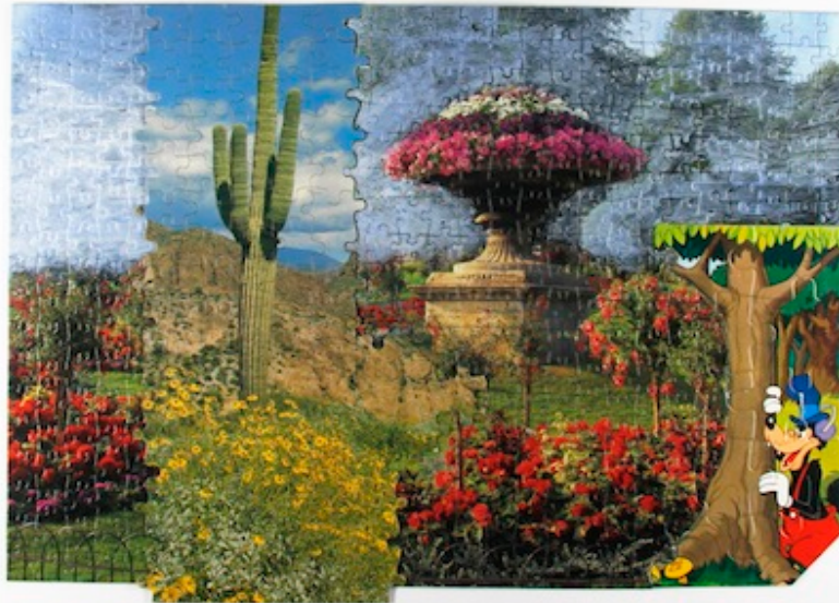
Figure 2: Lonesome Ghosts , 2015. Jigsaw and paint, 62cm x 56 cm.

The first series of jigsaw works (Figures 2-5) were made as an initial foray into the process of re-construction as an individual response to visualize the ideas around hybridity, many of which are a result of interactions with Aboriginal artists from both urban and remote regions of western Australia. These works focused on the construction of Australian landscape from the mythological position of European Arcadia, as a simulation of the natural world in the form of a gentrified mutation of colonial ideals within contemporary parklands. These nostalgic narratives involve early Disney characters as a reference to Freud's fantasy and reality, and as a reminder of propaganda and prejudice through the animalisation of race 4 (Brode 2005; Willetts 2013).