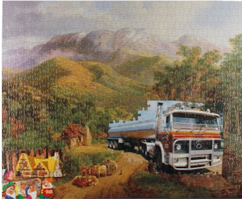
Figure 4: Buffalo Drought , 2015. Jigsaw, 62cm x 56 cm.