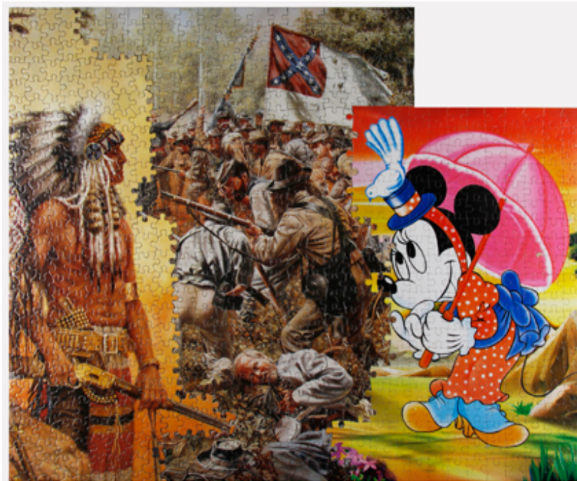
Figure 9: War , 2015. Jigsaw and paint, width 62cm x 56 cm.

Through the various collaborations with Chinese artists, it became apparent that Chinese Shan-Shui-Hua 9 landscape brush painting comes closest to the idea of a multi dimensional space that avoids the pitfalls of Araeen's identity politics. A link to Daoism materialises in the three main elements of Shan-Shui-Hua art, those of the