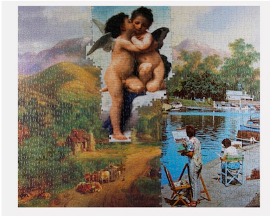
Figure 5: Piece , 2015. Jigsaw, 62cm x 56 cm.

In these works the theme of a shared public space emerges, as evidence of 'restorative' nostalgia as defined by Deleuze and Guattari as a nostalgia that focuses on nostos 5 with aims to reconstruct the lost home, often in association with religious or nationalist revivals (Legg 2004). Where nostalgia serves to retain lost homelands, spoken language has become less geographically bound through migration and Diasporic flows. For those languages that have survived colonisation, the aspect of miscommunication across languages suggests a relationship between body, time and place that is less defined, or what Lefebvre refers to as 'the unassignable interstice between bodily space and bodies-in-space' (1991, 251).