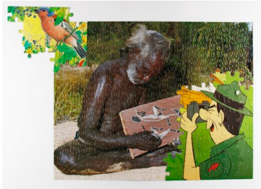
Figure 3: Flora, Fauna and the Ranger , 2015. Jigsaw, 62cm x 56 cm.