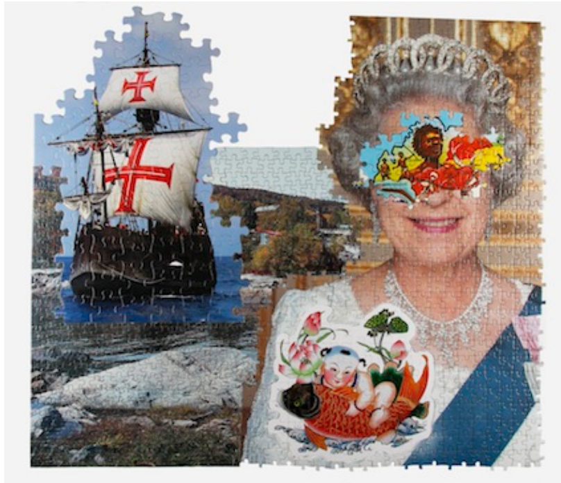
Figure 8: Uncool Britannia , 2015. Jigsaw, 62cm x 56 cm.