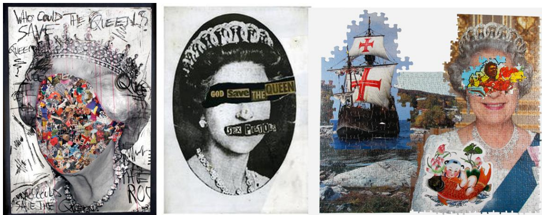
Figures 1&2 Vivien Westwood God Save the Queen (left & middle)

The underlying comic mimicry in my narrative work therefore acts to emphasise hybrid and misinterpreted language rather than to explain it; therefore, I assume the role of the trickster. As an example of this hybrid mimicry being used to examine and articulate the British-Australian-Chinese trialectic model, my work entitled Uncool Britannia (Figure 3) attempts a triangulation through its overt references to colonisation and culturally specific folklore, with its reference to Vivien Westwood's God Save the Queen series of graphic posters in the 1980s (figures 1 & 2).