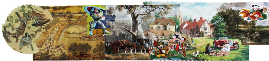
Figure 10 Clive Barstow Otherview

The Psychological observations of what is missing in Freud’s silent absence, as a metaphysical and ultimately disorienting construct of space, has connections to what Frank White (1987) termed the ‘overview effect’, where astronauts experience a cognitive shift in their sense of space while viewing earth from a distance. From this removed position, according to his interviews with returned astronauts, national boundaries disappear and the conflicts that divide people and nations become less significant. As White observes, “Although feelings of awe and self-transcendence associated with the overview effect are episodic... these changes seem primarily to entail greater affiliation with humanity as a whole, as well as an abiding concern and passion for the wellbeing of earth” (1987, 39).