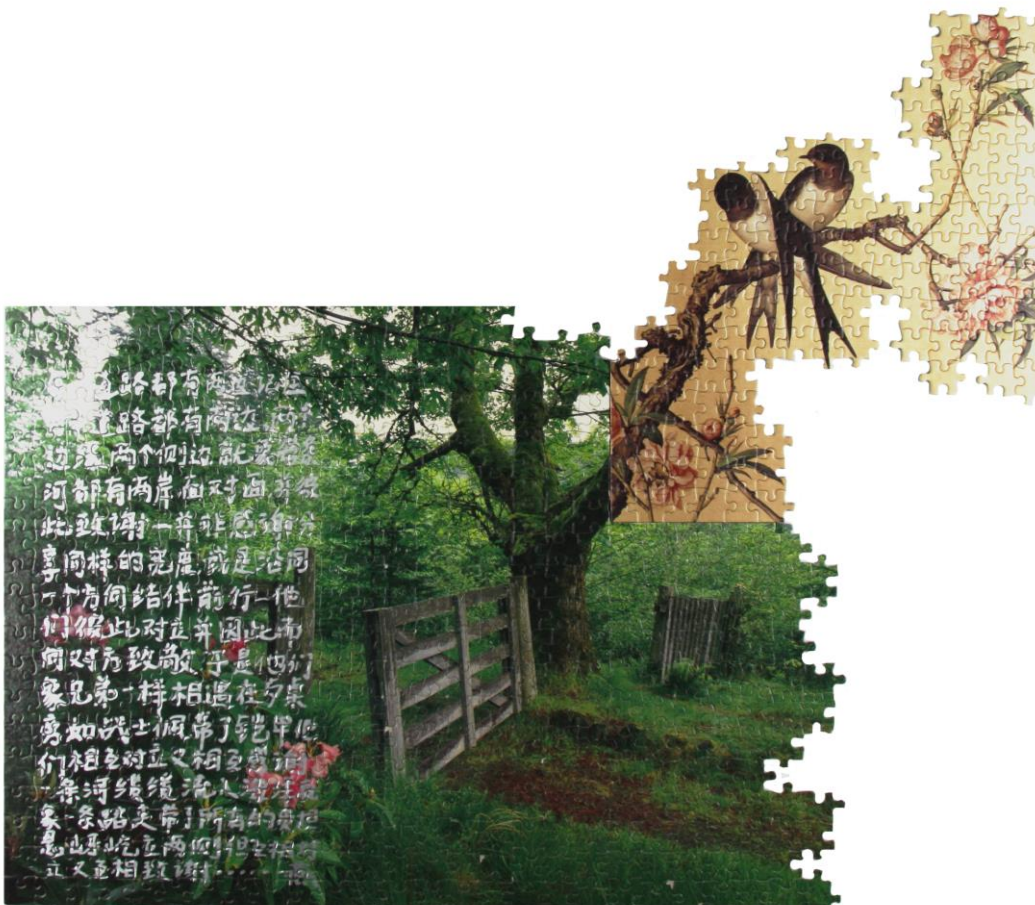
Figure 8 Clive Barstow & Glen Philips Every Road Has Two Paths

As an extension of the theme of native transformant across visual and written languages, Every Road Has Two Paths (Figure 8) translates a poem by contemporary poet Glen Philips. The image reflects a text that suggests the literal translation of Daoism as “The Way” or “The Road” as an explanation of change and transition as a process of reality itself. The image combines two interpretations of nature: one is a photographic construct of a British rural landscape; the other is a classic Chinese brush painting of birds, a symbol that reoccurs throughout my work as a meta-symbol of peace, life, death and deception. The tree transitions between East and West and between reality and illusion as a signifier of transference, while the path refers to Gillian Darley’s “narrative thread” (1997, 73), a connection between spaces and events that connects the road of Daoist philosophy to that of Arcadian idealism.