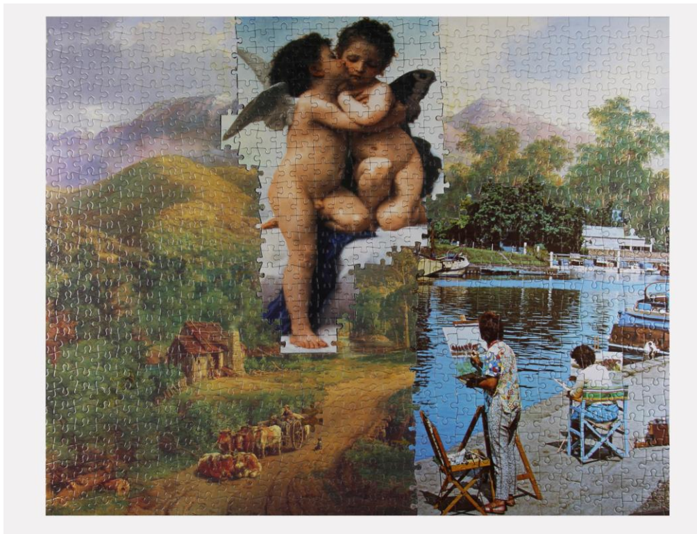
Figure 5 Clive Barstow Piece

European Arcadia, borrowing the horse and cart of Constable's Hay Wain , along with the chocolate-box rendering of the landscape in the English watercolour tradition. The romanticising of whiteness enters in the form of nymphs from Greek mythology, in this case from the 1890 romantic painting L'Amour et Psyche Enfants by William Adolphe Bouguereau, emphasising the basis of mythological constructs and the resulting realisation of shared belief systems through colonisation and indoctrination.