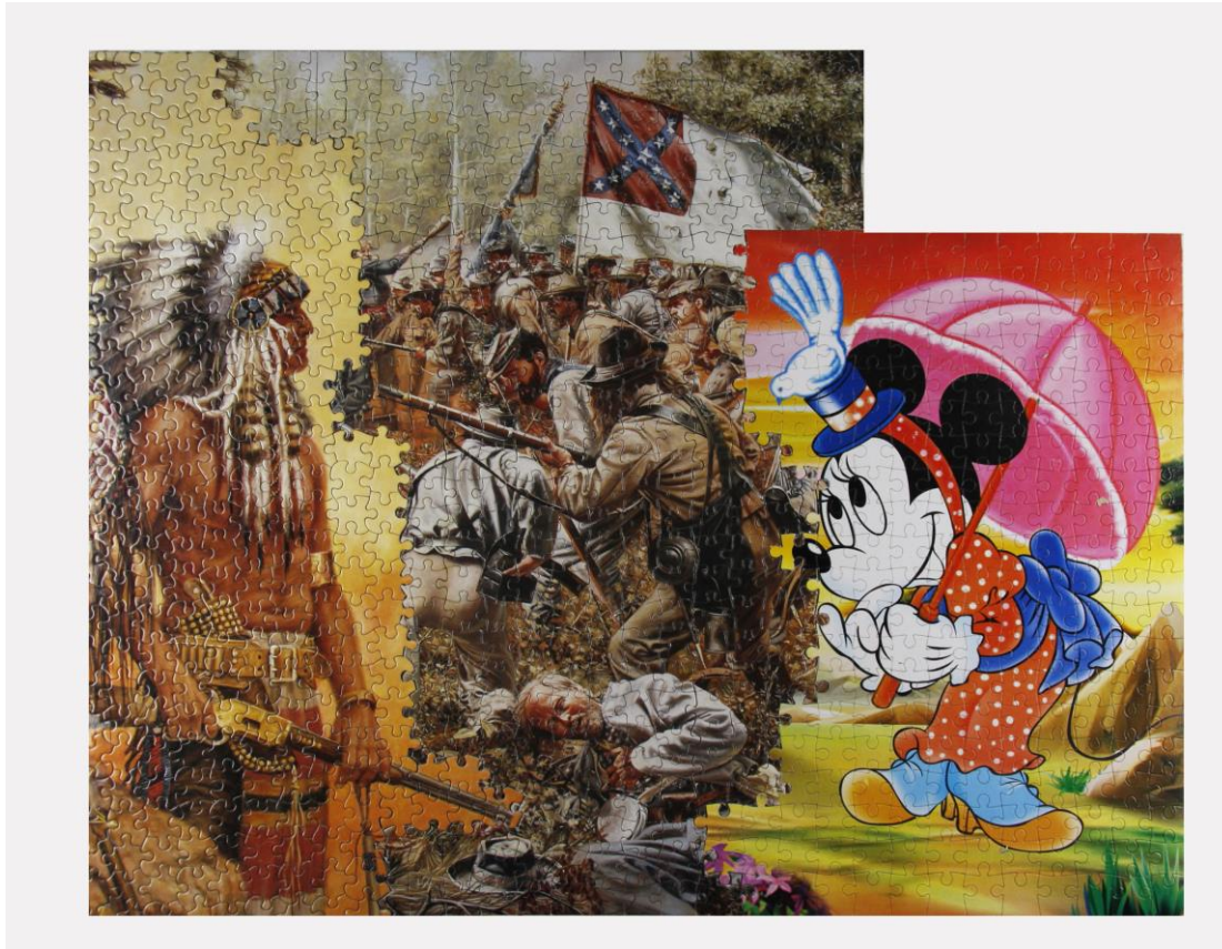
Figure 4 Clive Barstow War

Basquiat ( Death of Irony ), “which explicitly draws Australian and American colonial history and contemporary New York into the same narrative” (McLean 2003, 38).